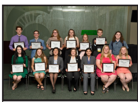
2019 State Award winners with their plaques at 4-H Exploration Days.